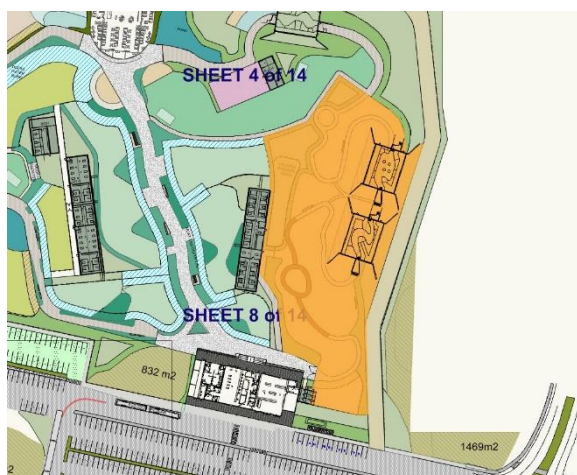
Figure 3 Approved Australiana Exhibit

As a result of the proposed design refinements, which have arisen from the adjustment in position of the Nocturnal, Reptile and Insect Pavilions, the Australiana walk-through exhibit space is calculated to be approximately 0.8ha, generally consistent with the area as it was approved. Figures 3 and 4 indicate the relative similarity in terms of area allocated to the walk-through of the proposed Australiana Exhibit, compared to the consent. The display of Australian animals therefore remains compliant with Condition B6 of the consent, which limits the area of Australian native animal display to a maximum of 1.6ha.