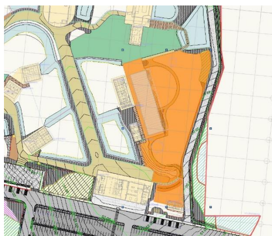
Figure 4 Proposed Australiana Exhibit